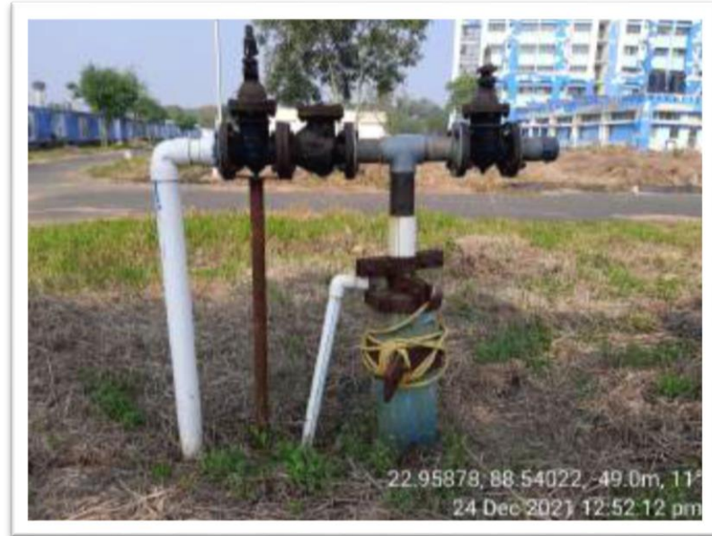
Fig. : 7.1.4.5.c. : Distribution of reclaimed water for gardening MAKAUT, WB. Haringhata campus.