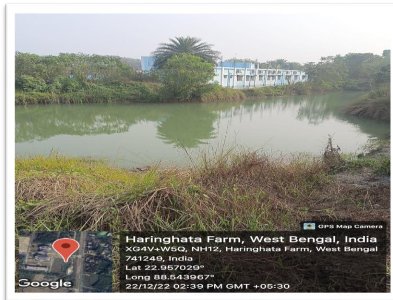
Fig. : 7.1.4.1.a. : Rainwater Harvesting Facility at MAKAUT, WB., Haringhata Campus.