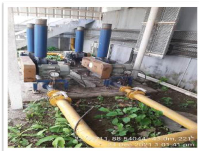
Fig. : 7.1.4.5.b. : Electrical motor and pump system for distribution of reclaimed water, MAKAUT, WB. Haringhata Campus.