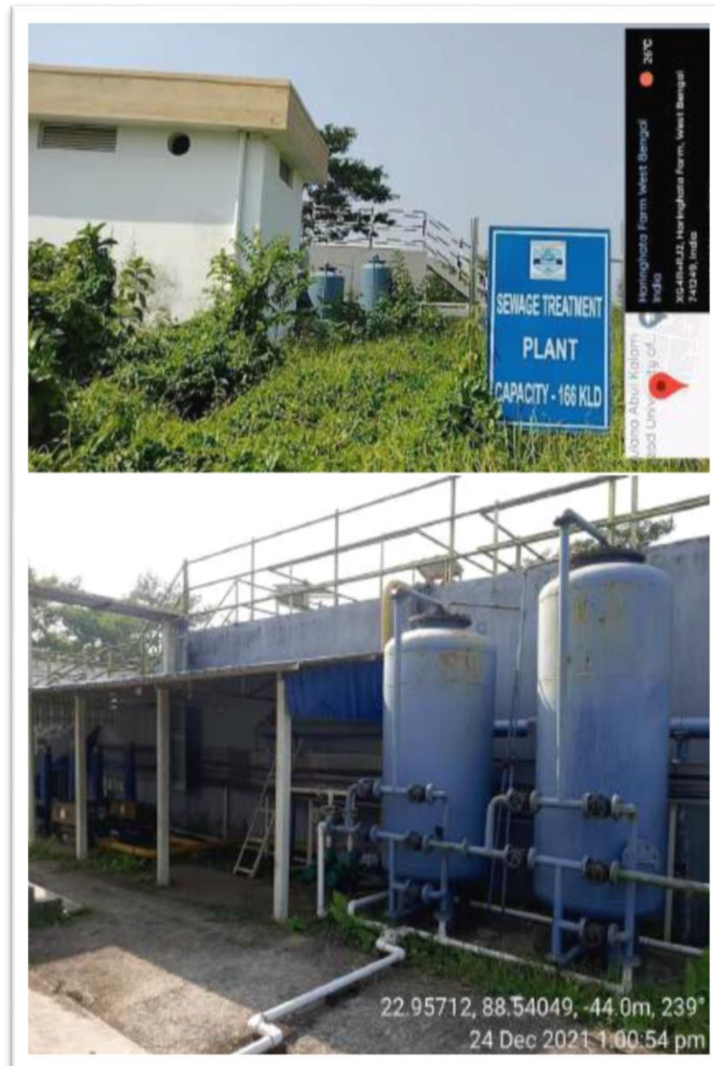
Fig. : 7.1.4.4. : Swerage Water Treatment at MAKAUT, WB., Haringhata Campus.