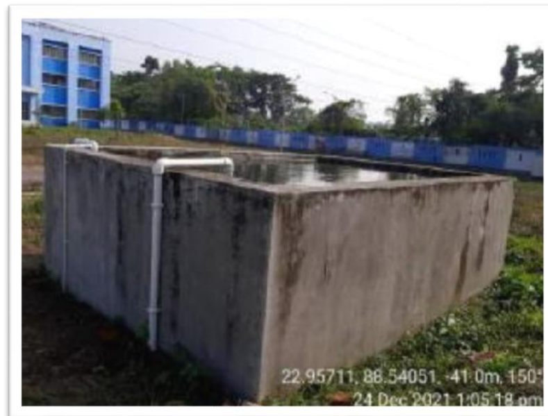
Fig. : 7.1.4.5.a. : Maintenance of water body for collection of water, MAKAUT, WB. Haringhata Campus.